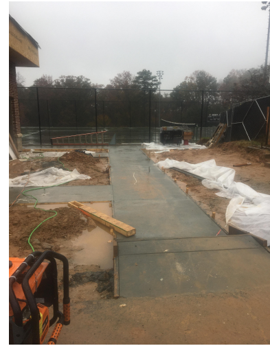
CSK- Sidewalk/stair concrete pour