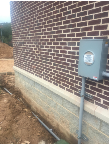
CSK- Permanent power prep

Client: Atlanta Public Schools Architect: JW Robinson & Associates Contractor: CD Moody Construction Company