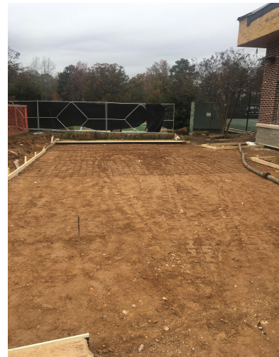
CSK- Walkway concrete prep